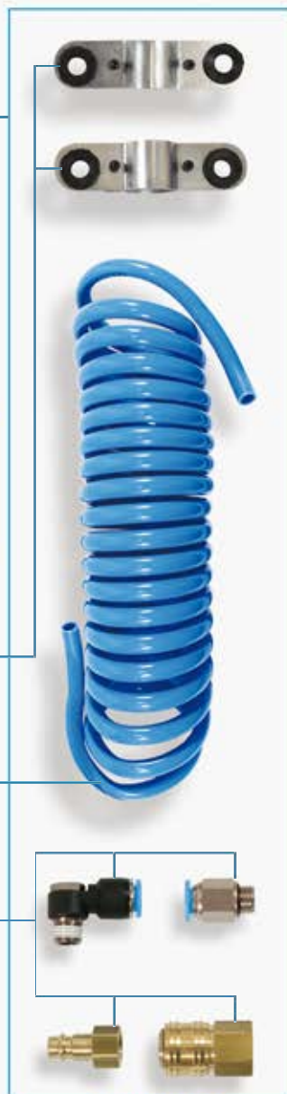
P931X / P932X